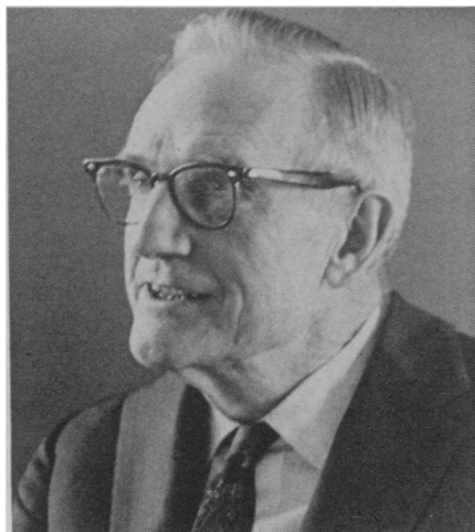
Rockefeller: Time to adopt a policy.

matched by the scarcity of public services if population growth continues at its present rate. Education accounted for about 7.5 percent of the gross national product, or $74 billion, in 1970. By the year 2000 it would account for 13 percent of the GNP with a three-child policy, but only 9.7 percent with a two-child average. Likewise, the efficiency of democratic governmental systems will continue to decline as the population climbs. And pressing social problems—racism and poverty—will only be aggravated as the population grows.