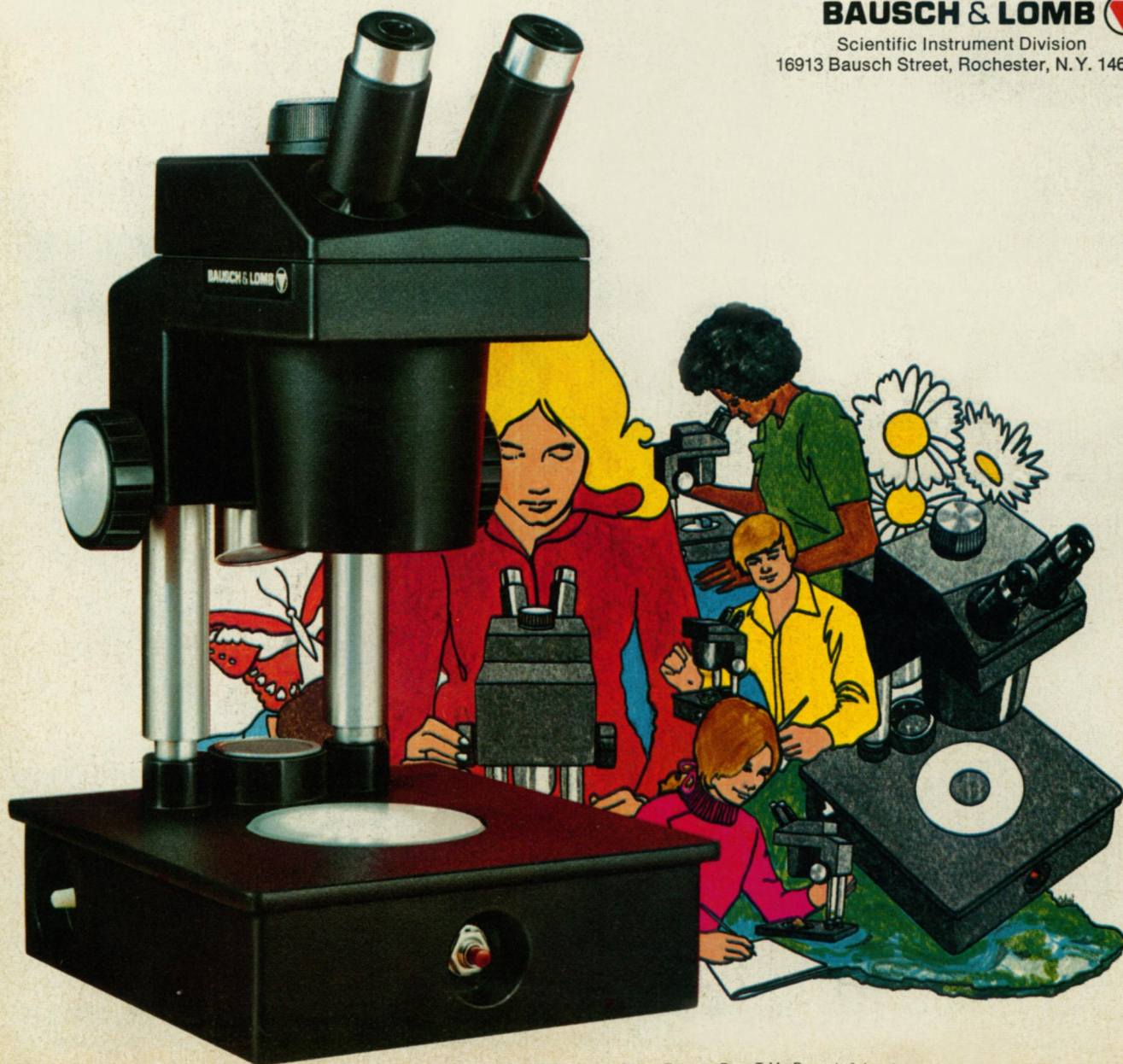
StereoZoom. Reg. T.M. Bausch & Lomb

Scientific Instrument Division 16913 Bausch Street, Rochester, N. Y. 14602