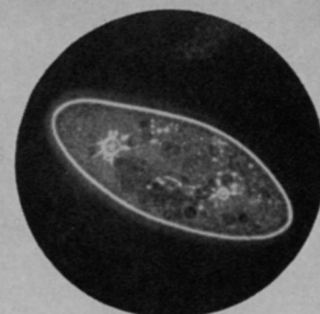
Phase Contrast unstained paramecium