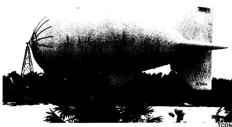
Balloon-borne antennas: Possible answer to communications needs.