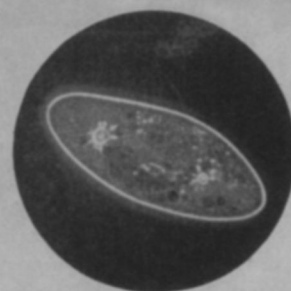
Phase Contrast unstained paramecium