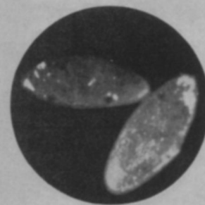
Darkfield unstained paramecium