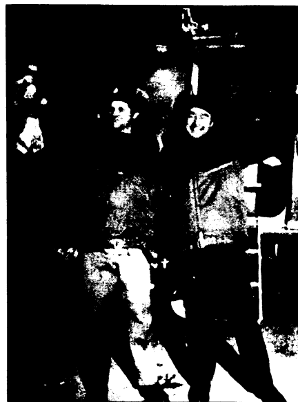
Gubarev and Grechko: A Soviet record.

Amid the hustle and bustle of missions ending and in the works, however, there was an event that caused sorrow among space hands both within and outside of the Soviet Union. Anatoly Blagonravov, head of the Soviet Research Institute and long the chairman of the Commission for the Exploration and Exploitation of Cosmic Space of