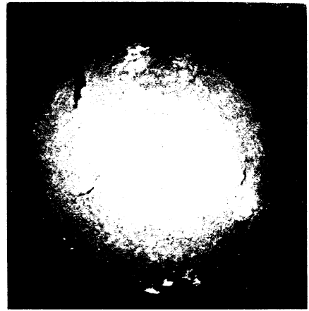
Sun: Maybe its luminosity is variable.

variability is confirmed, solar physicists will have to build it into their models, and those models are in enough trouble already predicting things that can't be found, that they don't need this shock. In July 10 NATURE, A.J. Meadows of Leicester University in England, reviewing attempts to connect changes in the weather with variations of the sun (mainly sunspots) remarks: "If the sun's luminosity can no longer be regarded as a variable, attention must . . . turn to . . . magnetic fields, particle emission and high energy radiation." Well, now maybe not necessarily. □