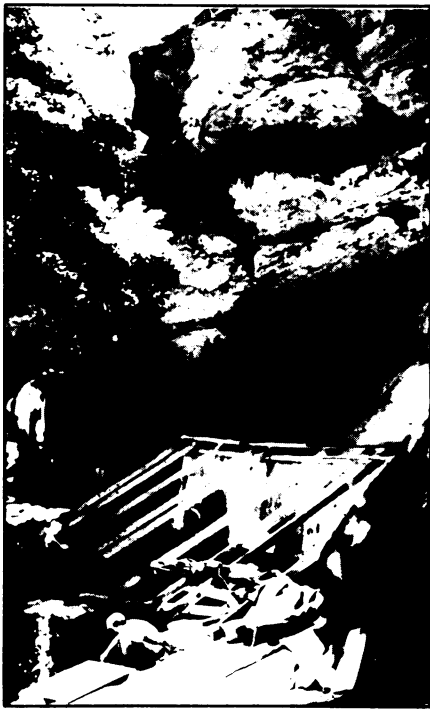
Meadowcroft Rockshelter: A perfect site for habitation 16,000 years ago.

When did the first Ice Age peoples cross the Bering Strait from Asia to the Americas and begin to populate the Western Hemisphere? The question is still open, but every year, after each summer's archaeological digs, the date is pushed back a little farther. Last year, students from the University of Pittsburgh unearthed charcoal samples that confirmed human habitation of a rockshelter near Avila, Pa., at about 14,000 to 15,000 years ago (SN: 8/10/74, p. 84). Carbon dating confirmed the site to be the oldest known area of human habitation in North America east of the Mississippi. This year, evidence from the same site pushes the date back to 16,000 years—the oldest confirmed date yet in the Western Hemisphere.