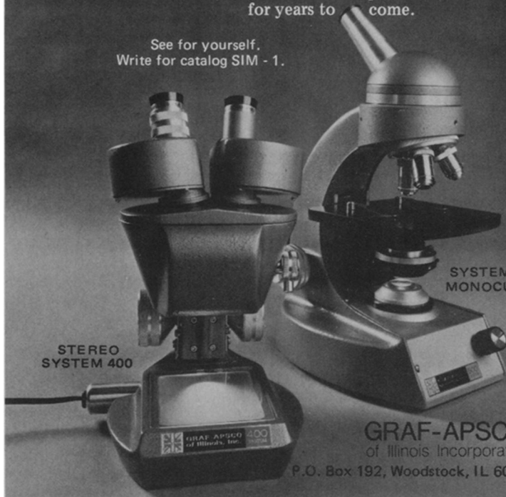
STEREO SYSTEM 400

See for yourself. Write for catalog SIM - 1.