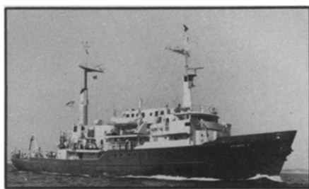
Atlantis II: Home at sea for 21 months.

collection of magnetic data from the sea-floor rocks, reflecting changes in the earth's magnetic field as well as move-