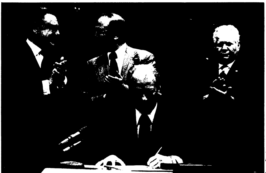
President Gerald R. Ford signs the National Science and Technology Policy, Organization and Priorities Act, renewing the office of White House Science Adviser. Behind him, looking on, are three men instrumental in the act’s passage: Vice President Nelson Rockefeller, Sen. Frank E. Moss (D-Utah) and Rep. Olin E. Teague (D-Tex.).