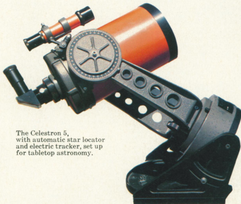
The Celestron 5, with automatic star locator and electric tracker, set up for tabletop astronomy.

Ask for our free color catalog. It shows why we're Number One. And still growing.