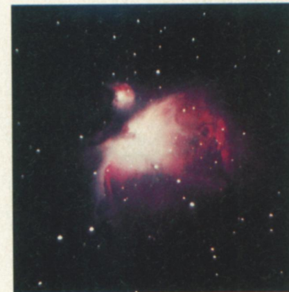
Top to bottom: Saturn, Celestron 14 photo; Lunar craters and Orion Nebula, both Celestron 8 photos.