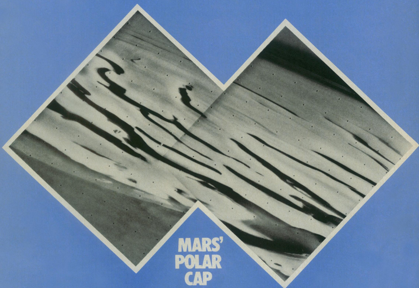
MARS' POLAR CAP