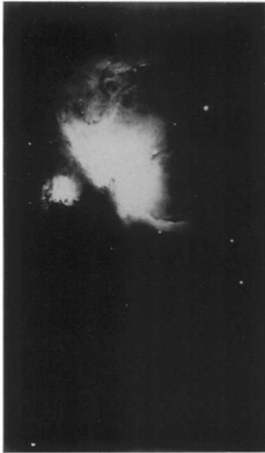
M42 (NGC 1976) The Orion Nebula. Kitt Peak 4 meter photo

from the KITZ PEAK NATIONAL OBSERVATORY and the CERRO TOLOLO INTER- AMERICAN OBSERVATORY