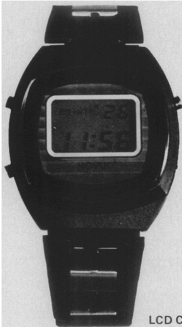
LCD Chronograph CH1B