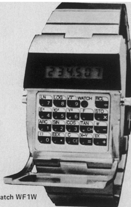
LCD Calculator/Watch WF1W