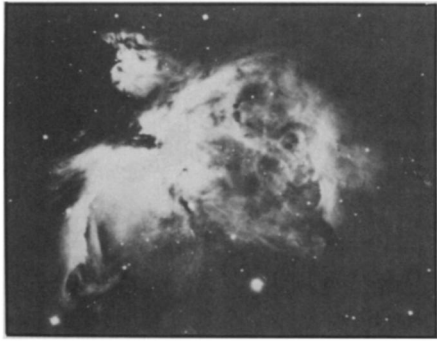
Orion nebula: Star nursery:

Astronomers who are interested in finding stars in the throes of being born have been looking more and more toward the constellation Orion. The nebula in that constellation has become the favorite hunting ground as observation has shown that it consists of dense clouds of dust and gases and that these clouds appear in some cases to be falling together. The theory of star formation says that a star begins when some disturbance causes clumping in one of these dust and gas clouds. The clump becomes a gravitational attraction for the rest of the cloud, and the cloud, or part of it, falls onto the clump. The condensing mass is heated by friction until thermonuclear burning begins, and a star is on its way.