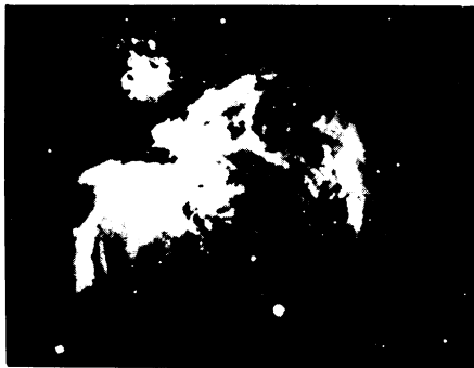
Orion nebula: Star nursery:

Astronomers who are interested in finding stars in the throes of being born have been looking more and more toward the constellation Orion. The nebula in that constellation has become the favorite hunting ground as observation has shown that it consists of dense clouds of dust and gases and that these clouds appear in some cases to be falling together. The theory of star formation says that a star begins when some disturbance causes clumping in one of these dust and gas clouds. The clump becomes a gravitational attraction for the rest of the cloud, and the cloud, or part of it, falls onto the clump. The condensing mass is heated by friction until thermonuclear burning begins, and a star is on its way.