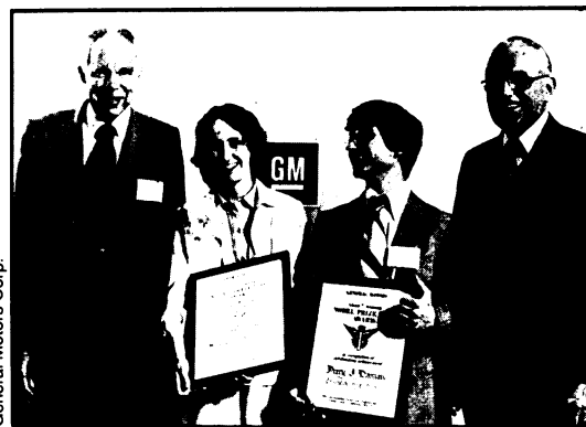
General Motors Corp.