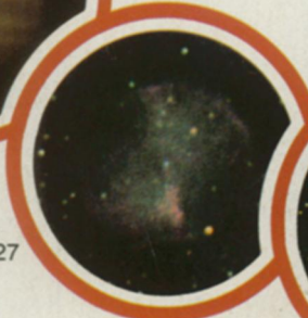
Dumbbell Nebula M27