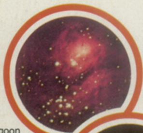
Lagoon Nebula M8

Celestron International 2835 Columbia Street Box 3578 N Torrance, Ca. 90503 (213) 328-9560