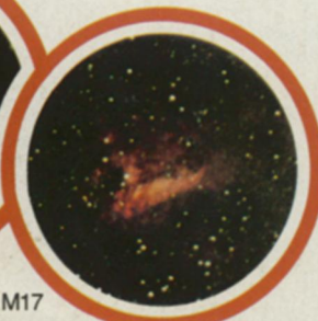
Omega Nebula M17