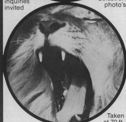
Taken at 70 ft.

Celestron Telescopes/Telephoto Lenses available from $245.00 to $3995.00, (3½" to 14" aperture). All have folded optical paths to give portability. Ideal for the casual observer, scientist, photographer or teacher.