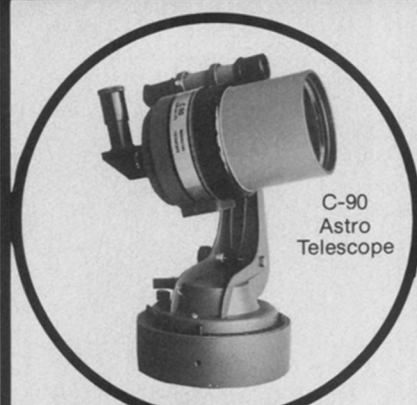
C-90 Astro Telescope