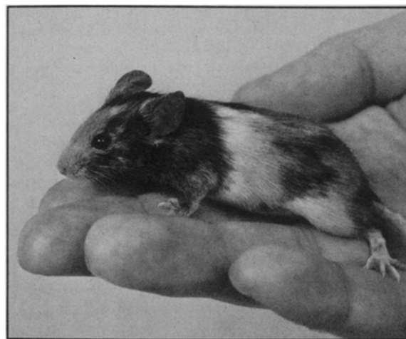
Multi-hued mouse produced in the lab.

A mouse with a coat of many colors is not in the offing with this embryo-merging technique. The researchers believe that three colors is probably the limit. Most of the 64 cells in the blastocyst develop into placenta, yolk sac and other extraembryonic structures; only a few contribute to the fetus and thus to the adult mouse. The successful manufacture of triple chimeras sets a clear lower limit: At least three cells must be allocated to form the adult organism. Statistical analyses of the many