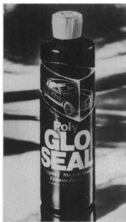
Poly-GloSeal* makes standard waxes and polishes obsolete!

Enamel spray paint can't even get through the clear glass shield... When this new professional automotive product is demonstrated to car dealers the "spray paint test" is used. Poly-GloSeal* is applied to a car's hood. After it dries it is wiped off and a can of enamel spray paint is sprayed directly on it, along with Magic Marker and other solvents. Then the observers are astonished as all of these are wiped off the hood with a mere cloth. Nothing, not even dirt and dust can adhere to the surface!