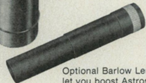
Optional Barlow Lenses let you boost Astroscan's power from 16X to 48X.