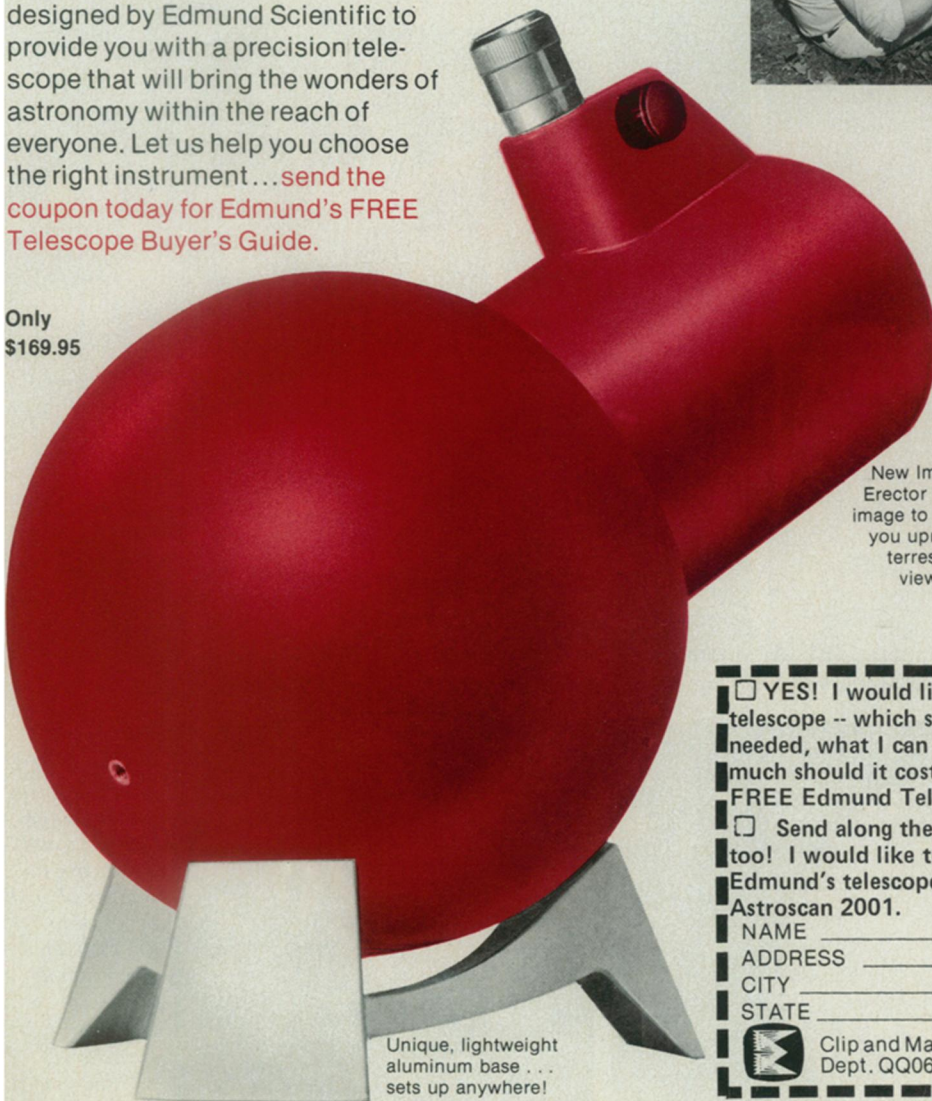
Unique, lightweight aluminum base... sets up anywhere!