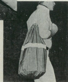
Optional Tote-Bag lets you carry scope and all accessories easily.

Compact and lightweight, the Astroscan goes where you go. Set it up in seconds... outdoors, indoors, anywhere. This versatile instrument, easily handled or cradled in your arms, becomes the perfect terrestrial telescope; or a simple adapter and you're ready for astrophotography.