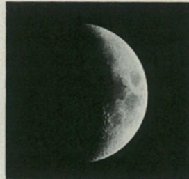
The Astroscan 2001 takes you to other worlds... and brings your own world a bit closer.