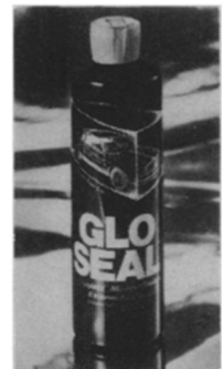
GloSeal* with Polyglass. Already on thousands of vehicles.

CALL TOLL FREE FOR INSTANT PROCESSING: 1-800-235-6945, or if busy 1-800-235-6951. Calif. res. please call 805-966-7187. Or send coupon: