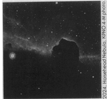
NGC 2024, Horsehead Nebula, KPNO 4-M photo.