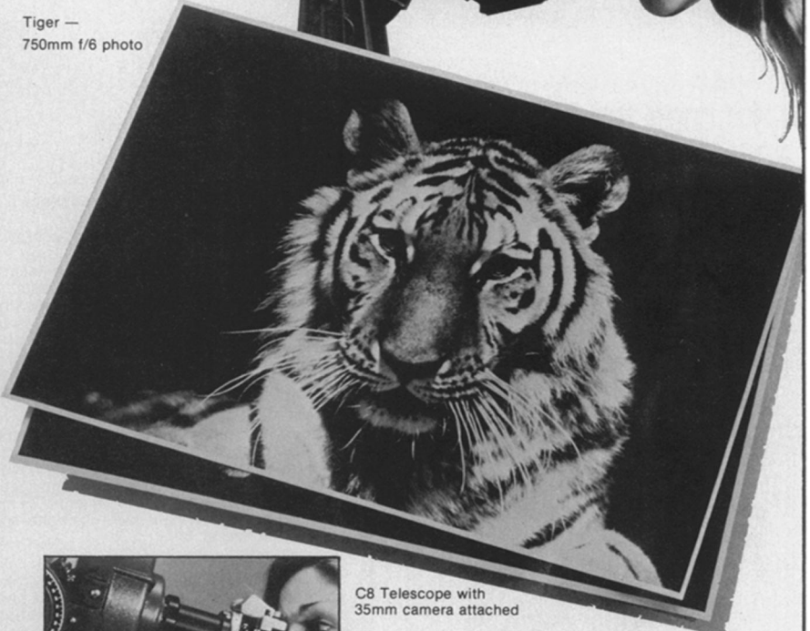
Tiger — 750mm 1/6 photo