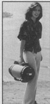
C8 one-hand portability

Free four-page brochure or send $2.00 for 32-page full-color catalog on how to select and use a Celestron telescope.