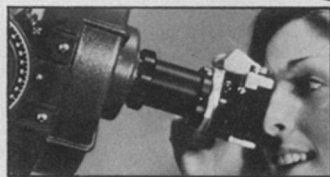
C8 Telescope with 35mm camera attached

35mm photography is as easy as adding your camera for exciting close-ups of your favorite subjects.