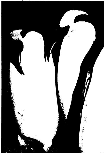
Tuxedoed emperor penguins trumpet with beaks pointing down.

Last summer two pairs of penguins in the breeding program, birds that had been captured as juveniles in 1977, finally copulated and each pair produced an egg. The activity was monitored by the research institute staff, and thus the sex of the marked birds was clearly established. Ann Bowles, a researcher from Scripps Ocean-