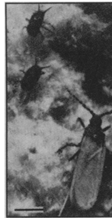
The Laetilia caterpillar (left) responds to a forcep "attack" by regurgitating droplets of carminic acid. The winged male and newborn Dactylopius — Laetilia prey and provider of carminic acid — "hide" in the white, waxy powder and silken threads produced by the female.

Carminic acid betrays its apparent defensive function in Dactylopius , however, in favor of the Laetilia caterpillar. While examining Dactylopius colonies, Eisner and colleagues found the caterpillars feeding on the scale insects. Moreover, when gently prodded or pinched, the caterpillars emitted droplets of carminic acid at a concentration slightly higher than that in Dactylopius . A new series of ant tests indicated that the carminic acid in Laetilia also probably serves as a chemical defense.