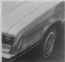
Touch-up body work

Fast and simple to operate... Fill the can 2/3 full with the liquid to be used, thinning according to instructions. Screw on the Aerosol Valve Top and pressurize to 50 psi with any bicycle pump, air hose or other air source (a unique pressure relief valve insures against overcharging). When the large (1 pint) can is empty, simply re-fill and pressurize. You're back to the job in minutes. When finished, clean the can thoroughly and you're ready for your next project!