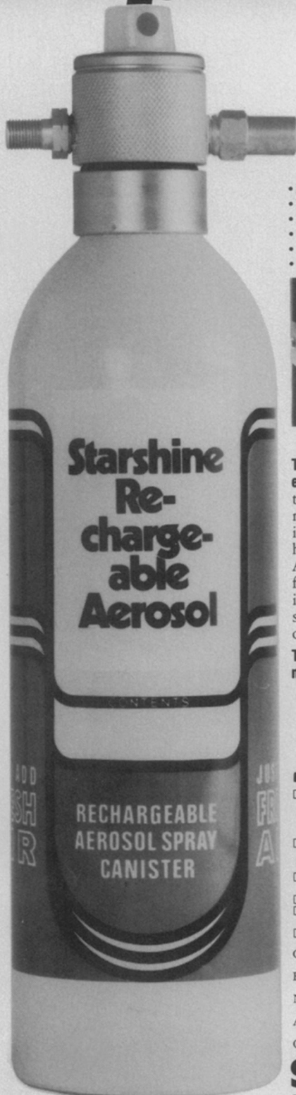
Large size can: 2½"Wx8"H

Genuine Professional results... without the noise and hassles of a cumbersome and expensive compressor. Starshine's Rechargeable Aerosol is a quality spraying instrument...the first of its kind for home, garden and industrial use. It is available only from Starshine's Mail Order Sales Division and arrives quickly at your door complete with two interchangeable spray heads. One, a wide angle spray, is for flawless application of paints and other liquids requiring an even coating. The other, a special extension tube, is for applying lubricants, cleaners, etc., in hard-to-get-at places such as complex electronic equipment.