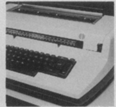
Lube office equip.

Tough, precision construction plus Starshine's exclusive 5-year guarantee. Designed in England, the solid canister is one-piece aluminum with no seams to come apart. The aerosol valve body is also solid aluminum and knurled for easy handling. Should your Starshine Rechargeable Aerosol ever malfunction due to a manufacturing defect within 5 years, you may return it for repair or replacement at our prompt service-by-mail facility. We pride ourselves on our quick, courteous service.