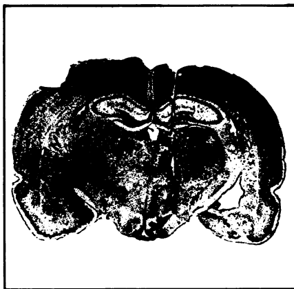
Injection of gastrin in rat hypothalamus (arrow) caused secretion of gastric acid.

They injected gastrin into the hypothalamus of rats and measured gastric acid secretion from the animals' stomachs. Gastrin consistently caused gastric acid secretion to double or triple 15 minutes later. In contrast, the injection into the hypothalamus of other proteins common to the gut and brain did not increase stomach