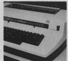
Lube office equip.

Tough, precision construction plus Starshine's exclusive 5-year guarantee. Designed in England, the solid canister is one-piece aluminum with no seams to come apart. The aerosol valve body is also solid aluminum and knurled for easy handling. Should your Starshine Rechargeable Aerosol ever malfunction due to a manufacturing defect within 5 years, you may return it for repair or replacement at our prompt service-by-mail facility. We pride ourselves on our quick, courteous service.