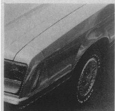
Touch-up body work

Fast and simple to operate... Fill the can 2/3 full with the liquid to be used, thinning according to instructions. Screw on the Aerosol Valve Top and pressurize to 50 psi with any bicycle pump, air hose or other air source (a unique pressure relief valve insures against overcharging). When the large (1 pint) can is empty, simply re-fill and pressurize. You're back to the job in minutes. When finished, clean the can thoroughly and you're ready for your next project!