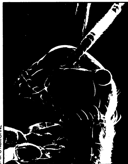
Extra compound eye in cricket treated during egg stage with acridine contaminant.

But little else is known about the mysterious teratogen, and research continues in an attempt to isolate and characterize the impurity or impurities in acridine. Meanwhile, Walton also has discovered that treating cricket eggs with synfuels also causes abnormal insect development.