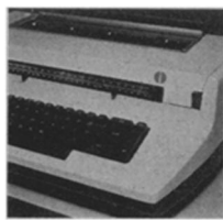
Lube office equip.