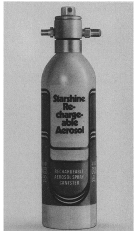
Large size can: 2½"W x 8"H

Tough, precision construction plus Starshine's exclusive 5-year guarantee. Designed in England, the solid canister is one-piece aluminum with no seams to come apart. The aerosol valve body is also solid aluminum and knurled for easy handling. Should your Starshine Rechargeable Aerosol ever malfunction due to a manufacturing defect within 5 years, you may return it for repair or replacement at our prompt service-by-mail facility. We pride ourselves on our quick, courteous service.