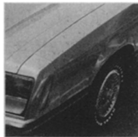
Touch-up body work

Fast and simple to operate... Fill the can 2/3 full with the liquid to be used, thinning according to instructions. Screw on the Aerosol Valve Top and pressurize to 50 psi with any bicycle pump, air hose or other air source (a unique pressure relief valve insures against overcharging). When the large (1 pint) can is empty, simply re-fill and pressurize. You're back to the job in minutes. When finished, clean the can thoroughly and you're ready for your next project!