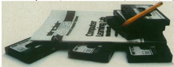
For an extra $49.95, you can also have the Sinclair Computer Learning Lab—a set of 100 experiments and lessons on cassette tapes that make the ZX80 itself your teacher.

For your 10-day home trial, just call our toll-free number and order with your Master Charge or VISA. Or send the coupon along with a check or money order for the remarkably low price of $199.95, plus shipping. (Other personal computers cost two or three times as much!)