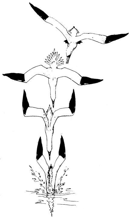
B. Nelson, The Gannet , Poyser, Berkhamsted, 1978

A large seabird hovers high above the ocean. It sights its prey and plunges down with wings half open. Then just before hitting the water, it starts to fold its wings so that its body is streamlined for entering the water.