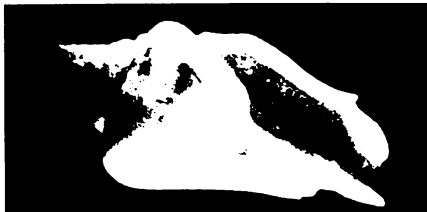
Gastropods from Guam — Rhinoclavis aspera (top) and Strombus gibbenilus — exhibit shell repair after attack.