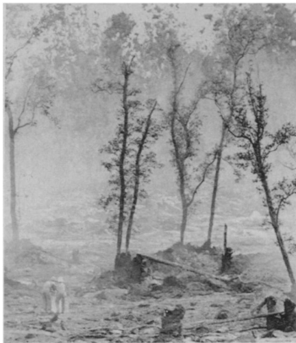
Geologists at Kilauea's east rift monitor the fiery progress of the recent eruption.

As for California, there is no eruptive activity at the basin-shaped Long Valley caldera near the popular ski resort town of Mammoth Lakes, and scientists are unsure if, or when, the volcano will erupt. The sequence, or swarm, of small earthquakes began the afternoon of Jan. 6. While two relatively large shocks with Richter magnitudes of 5.5 and 5.6 occurred that day, inflicting some property damage, most of