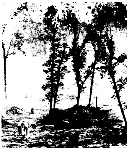
Geologists at Kilauea's east rift monitor the fiery progress of the recent eruption.

As for California, there is no eruptive activity at the basin-shaped Long Valley caldera near the popular ski resort town of Mammoth Lakes, and scientists are unsure if, or when, the volcano will erupt. The sequence, or swarm, of small earthquakes began the afternoon of Jan. 6. While two relatively large shocks with Richter magnitudes of 5.5 and 5.6 occurred that day, inflicting some property damage, most of