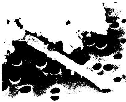
Scanning electron micrograph of enstatite ( MgSiO_3 ) rod (about 5 microns in length) within an interplanetary dust particle.

Although the mineral enstatite, or pyroxene, is common on earth, in various crystalline shapes, it has never been observed on earth or in lunar samples to form as rods and ribbons (whiskers), or platelets. This, along with internal microstructures in the crystals, leads Bradley to say, "There is no doubt that [the particles] are extraterrestrial. ... These particles have to be at least as old as the origin of the solar system. There is strong evidence