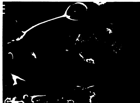
Young toad lies helpless and dying in the mud as fly larva sucks its body fluids dry (left). In many cases, the larva appears a match in size to its prey.

"This was unusual, because everyone knows that frogs and toads eat flies," Eisner says. Now, here were the flies—in their larval stage—eating the toads (actually, the larvae sucked the toads dry of