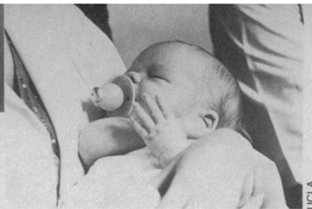
First baby born in womb-to-womb relay of developing embryo (inset).

specially designed catheter used to wash out the donor uterus guarantees retrieval of the egg in "nearly all" cases, and probably prevents implantation of any egg that might be missed.