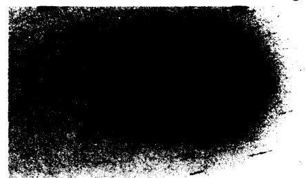
Comet Kopff (above; negative print from Kitt Peak National Observatory, Aug. 1983) is proposed target for 1990s space probe that would cruise near it for years after first flying past two asteroids.

It is also planned as the first of a new generation of planetary spacecraft, called Mariner Mark II, now being studied at Jet Propulsion Laboratory in Pasadena, Calif. The craft is envisioned in various config-