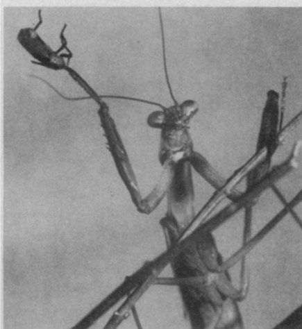
Mantis casts aside foul-tasting prey.