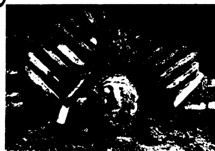
Burial towers are decorated with carved wooden figures under the eaves, as well as geometric designs (left). A carved stone head fringed with stones resembling a feather headdress stares from the wall of a building (right).