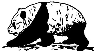
GIANT PANDA (6 ft. long)

The Webster's is strong on visuals, too. Finely detailed pen drawings appear throughout the text, and there's a full section of color-plate illustrations of plants, animals, airplanes, ships, and more. These illustrations help make the Webster's a fun, visually exciting learning experience, especially for children.