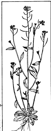
from Drawings of British Plants

Animal geneticists owe their success to mice and the fruit fly Drosophila ; microbial geneticists are indebted to the bacterium E. coli . Now molecular biologists propose that a small weed will prove to be a similar boon to plant geneticists.