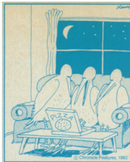
“Let's see — Mosquitos, gnats, flies, ants . . . What the? . . . Those jerks! We didn't order stink bugs on this thing!”

Over 600 comic panels plus 8 full-color mini-posters from Larson's The Far Side , Beyond The Far Side and In Search of The Far Side are brought together in one omnibus collection in The Far Side Gallery .