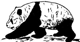
GIANT PANDA (6 ft. long)

The Webster's is strong on visuals, too. Finely detailed pen drawings appear throughout the text. These illustrations help make the Webster's a fun, visually exciting learning experience, especially for children.