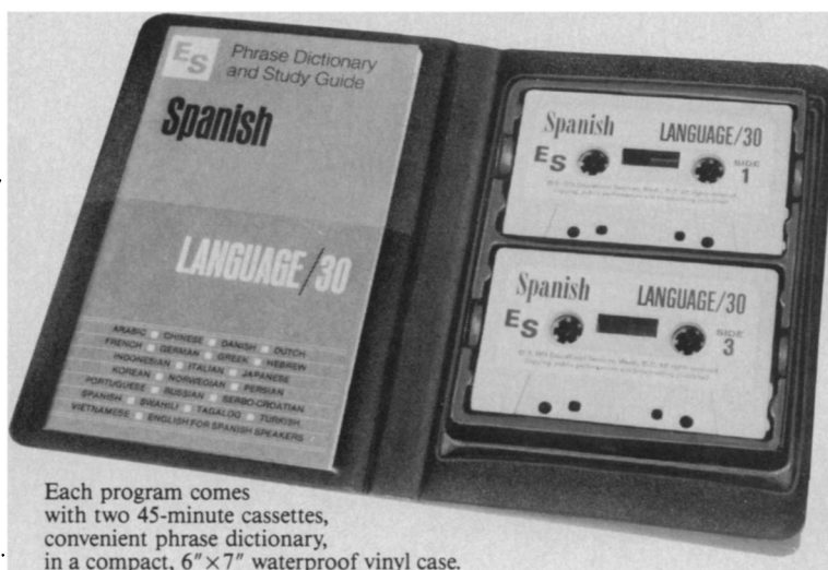
Each program comes with two 45-minute cassettes, convenient phrase dictionary, in a compact, 6" x 7" waterproof vinyl case.

So, whether you're going abroad for a short trip or an extended stay, you'll find that the fluency you've gained from Language / 30 will make your visit easier, more pleasant, and more enriching. Instead of being a "stranger in a strange land," you'll be able to converse freely with the natives in their own language.