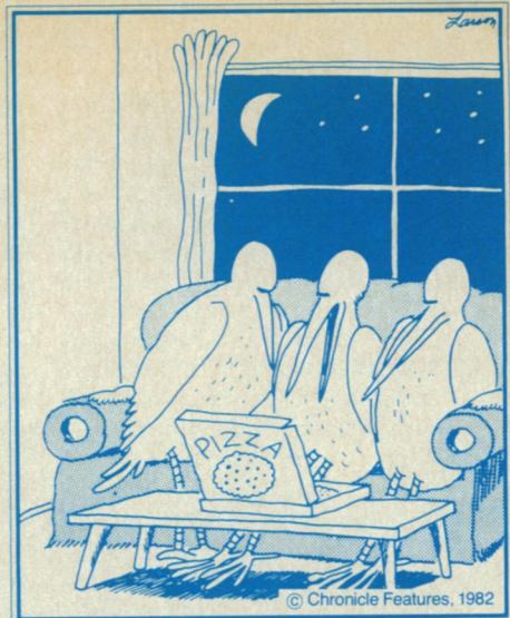
"Let's see — Mosquitos, gnats, flies, ants . . . What the? . . . Those jerks! We didn't order stink bugs on this thing!"

Over 600 comic panels plus 8 full-color mini-posters from Larson's The Far Side , Beyond The Far Side and In Search of The Far Side are brought together in one omnibus collection in The Far Side Gallery .